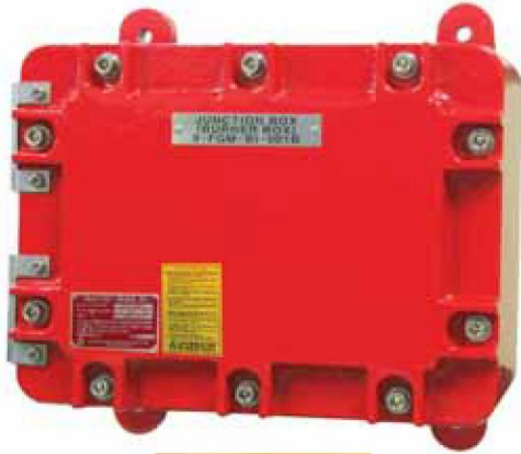
Type of Explosion-Proof Flameproof (Ex d IIB+H2 T6)